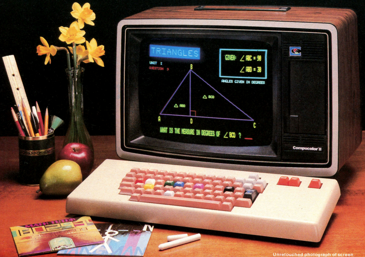
Unretouched photograph of screen.